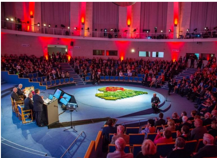
Associations, Working Groups and other Czech

The official journal of our society is Cor et Vasa . The journal was founded 1958. From 2012 Cor et Vasa is issued six times per year, published in Czech and English in parallel. It contains original research papers, reviews, editorials and abbreviated ESC guidelines. The journal covers all aspects of cardiology, vascular medicine and cardiovascular surgery. The second journal of our society is a fully digital Cor et Vasa Case Reports , allowing rapid publication of case reports particularly to young beginning researchers and clinicians.